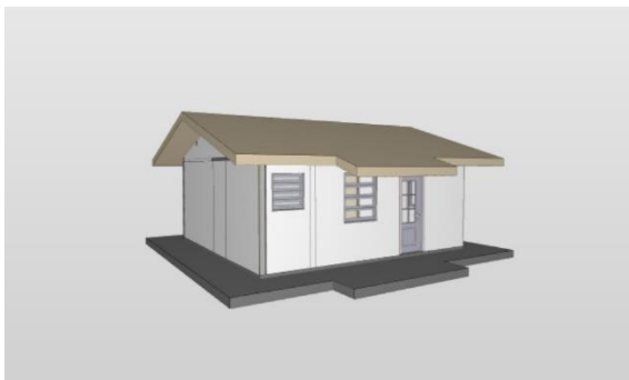
Figure 2: 3D model of a CDHU house. Source: author